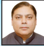
Md Nadimul Haque Member of Parliament Rajya Sabha, Govt. of India