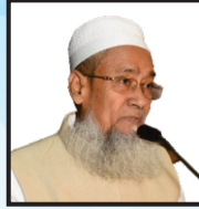
MI Siddiqullah Chowdhury Minister- Mass Education Extension & Library Services, Govt. of W.B.