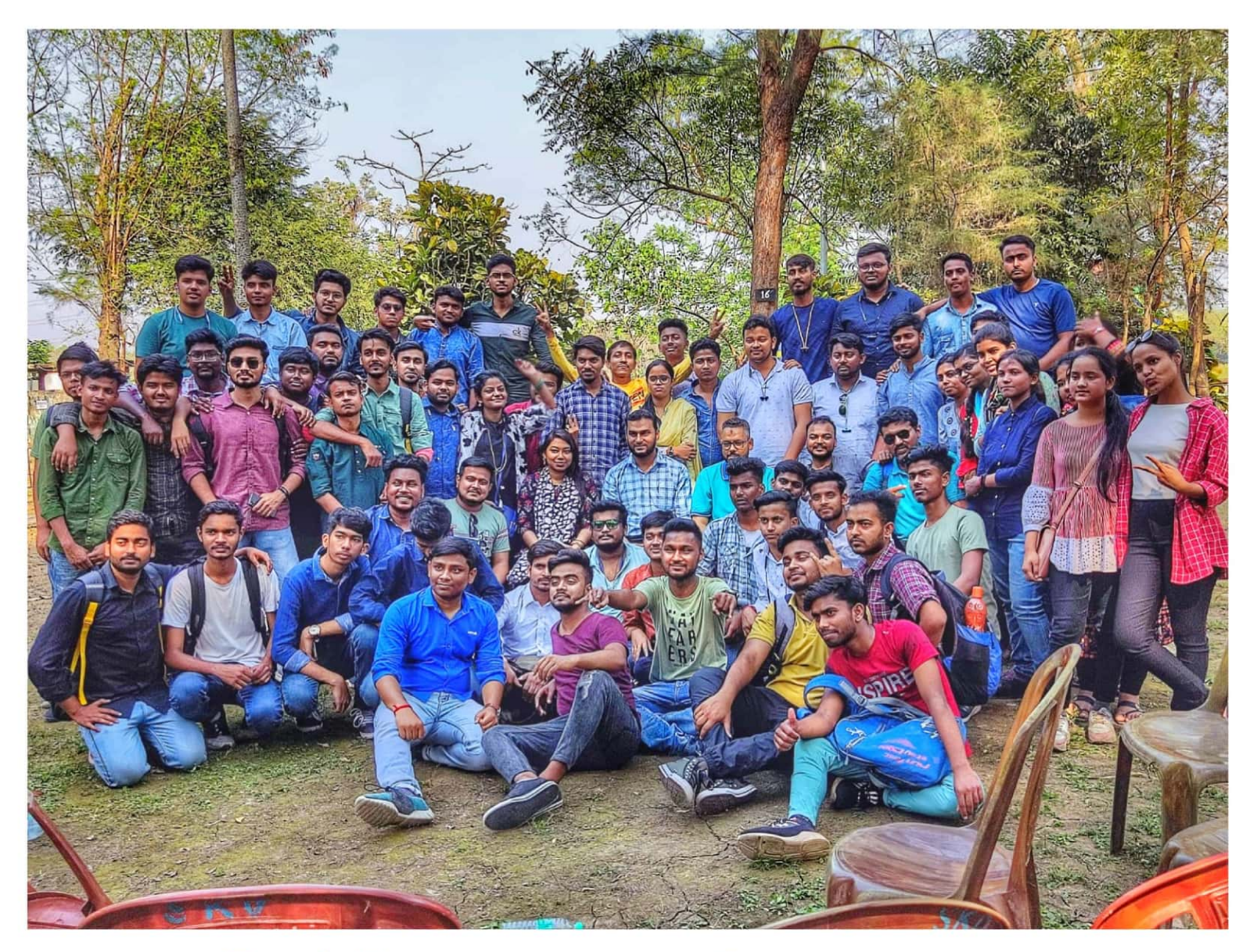
Civil Engineering Department